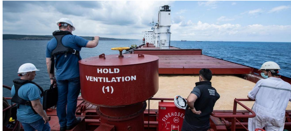
The first commercial vessel carrying grain under the Black Sea Grain Initiative.