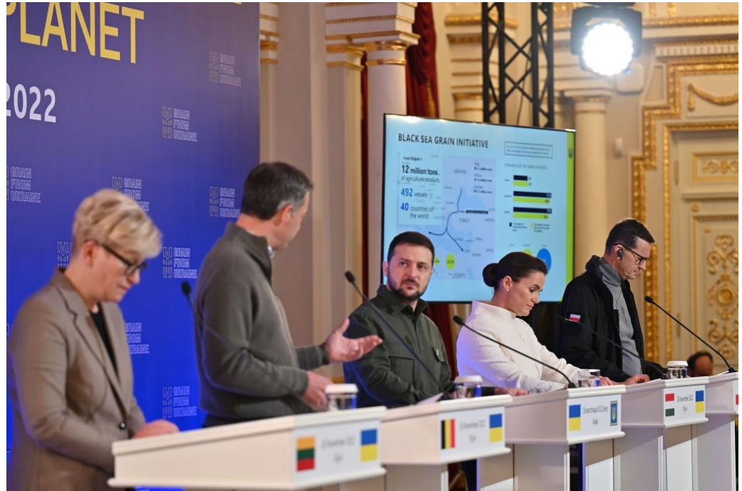
Participation of the President of Ukraine in the inaugural International Summit on Food Security. 26 November 2022. The Presidential Office of Ukraine