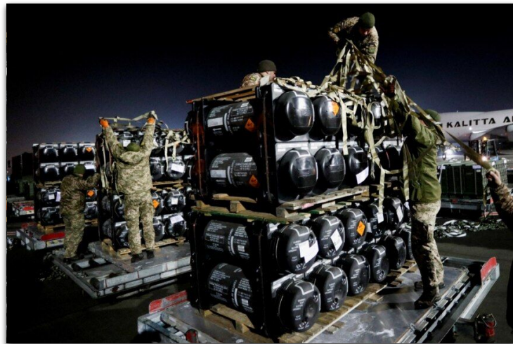
Ukrainian service members unpack Javelin, Feb. 10, 2022.