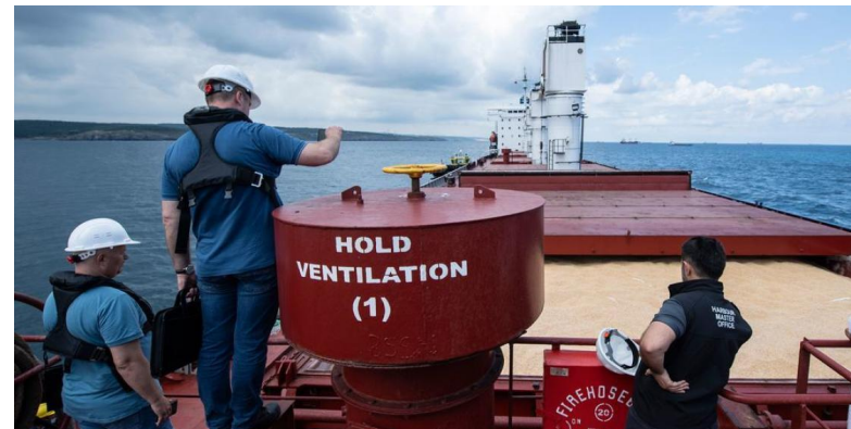
The first commercial vessel carrying grain under the Black Sea Grain Initiative.