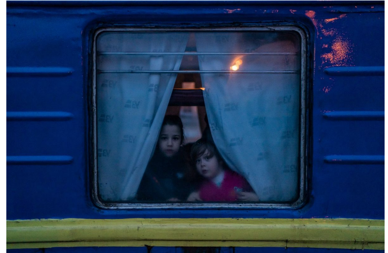
Children peer out of a window as a train prepares to depart Odessa, Ukraine, for Lviv in March.