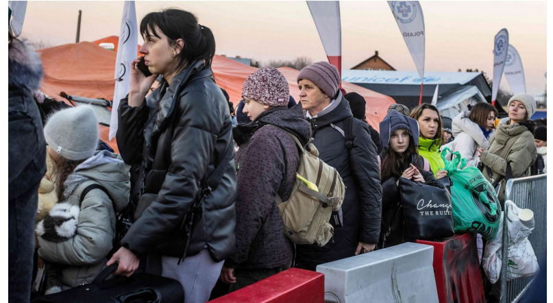
People line up to get into the buses for further transportation at the Polish-Ukrainian border crossing

20,000 were admitted along the US-Mexico border