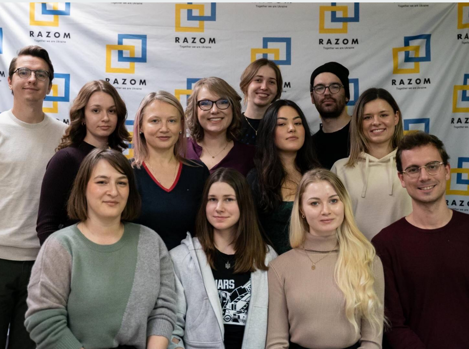
RAZOM Research Team