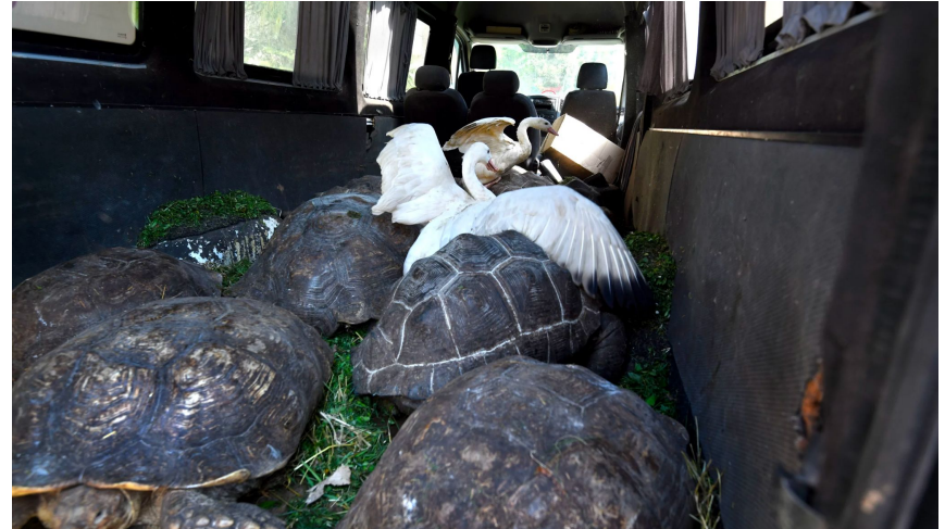
Tortoises and swans are loaded into a van for evacuation from Feldman Ecopark on May 2.